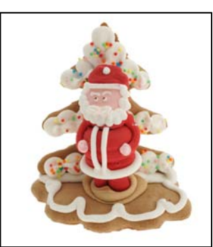
Ho Ho Ho !! Merry Christmas !!